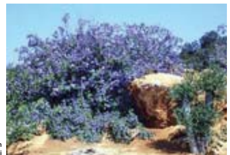
• Solanum Rantonettii