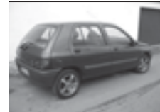
Renault - Clio 1.2 - 1996 - very good condition with MOT and guarantee. €2,600. Tel: 965 034 258

Hyundai - Accent - 1.3, 4d, 2005, grey. A/C, electric windows, central locking, PAS, radio/CD. €11,000. Auto Rent. Tel: 282 417 171. Email: ocasiao@autorent.pt