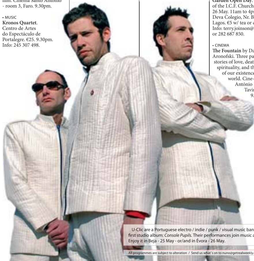
U-clíc are a Portuguese electro / indie / punk / visual music band. On February 2007 they released their first studio album: Console Pupils . Their performances join music and visual effects in a very artistic way. Enjoy it in Beja - 25 May - or/and in Évora - 26 May.

Laurie Anderson. Teatro circo, Braga. 13 July. Info: www.theatrocirco.com.