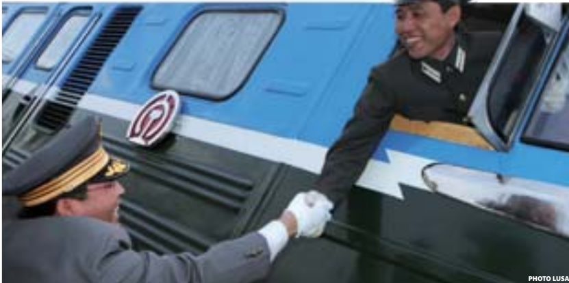
• A South Korean train conductor (left) shakes hands with a North Korean train conductor at Jejin station.

north. Children bearing flowers welcomed the North Korea train into Jejin station. The south has been asking for this service for many years to improve relations and to enable easier transport into China. The lines were reconnected two years ago by South Korea and all landmines and tank traps were removed.