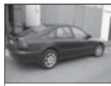
Honda - 2.0i - 1993 - very good condition with MOT and guarantee. ONO. €5,500. Tel: 965 034 258.

Suzuki - Vitara - 1.9 Td 4x4 2000 electric windows, central locking. €7,000. Auto Rent. Tel: 282 417 171. ocasiao@autorent.pt