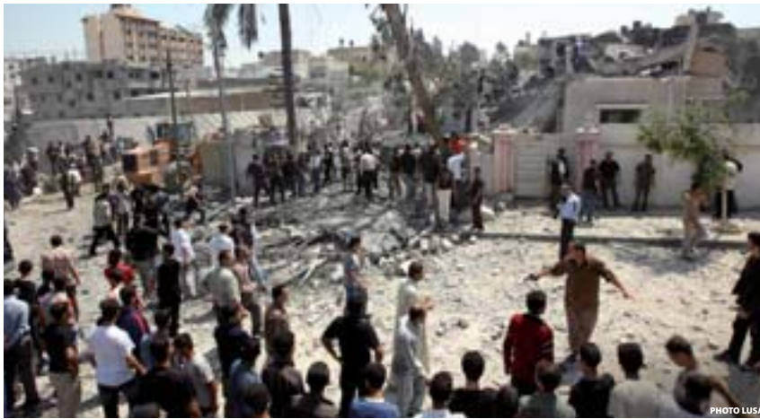
• Palestinians gather at the demolished building used by Hamas's Executive Force.

At the funerals of two Hamas militants in the town of Rafah, violence ended in the death of one man and around 20 injured when guns being fired into the air as is the custom at funerals were turned by Fatah militants into a bloody battle.