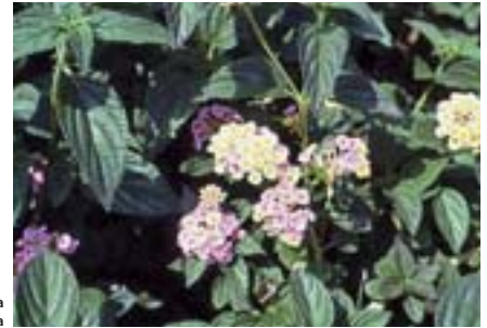
• Lantana Camara

The Hibiscus originates from China but is one of the most beautiful and characteristic shrubs of the Algarve that lends a touch of the tropics to this European sun spot.