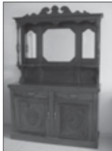
Antique dresser - offers please. Tel: 967 107 260

For Sale - Computer, windows 98, antivirus, printer Epson. Buyer collects. Lagos. Tel: 282 088 726